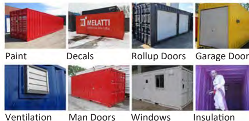
Paint Decals Rollup Doors Garage Doors Ventilation Man Doors Windows Insulation