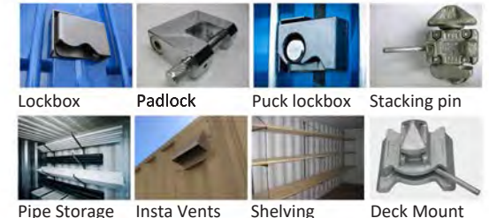
Lockbox Padlock Puck lockbox Stacking pin Pipe Storage Insta Vents Shelving Deck Mount